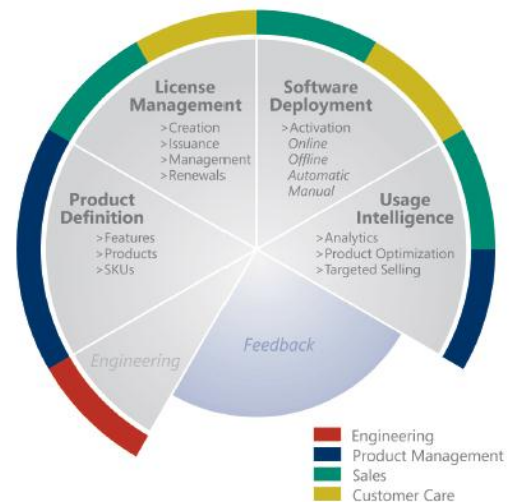
Complete License Lifecycle Management